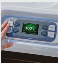
Colour LCD Display