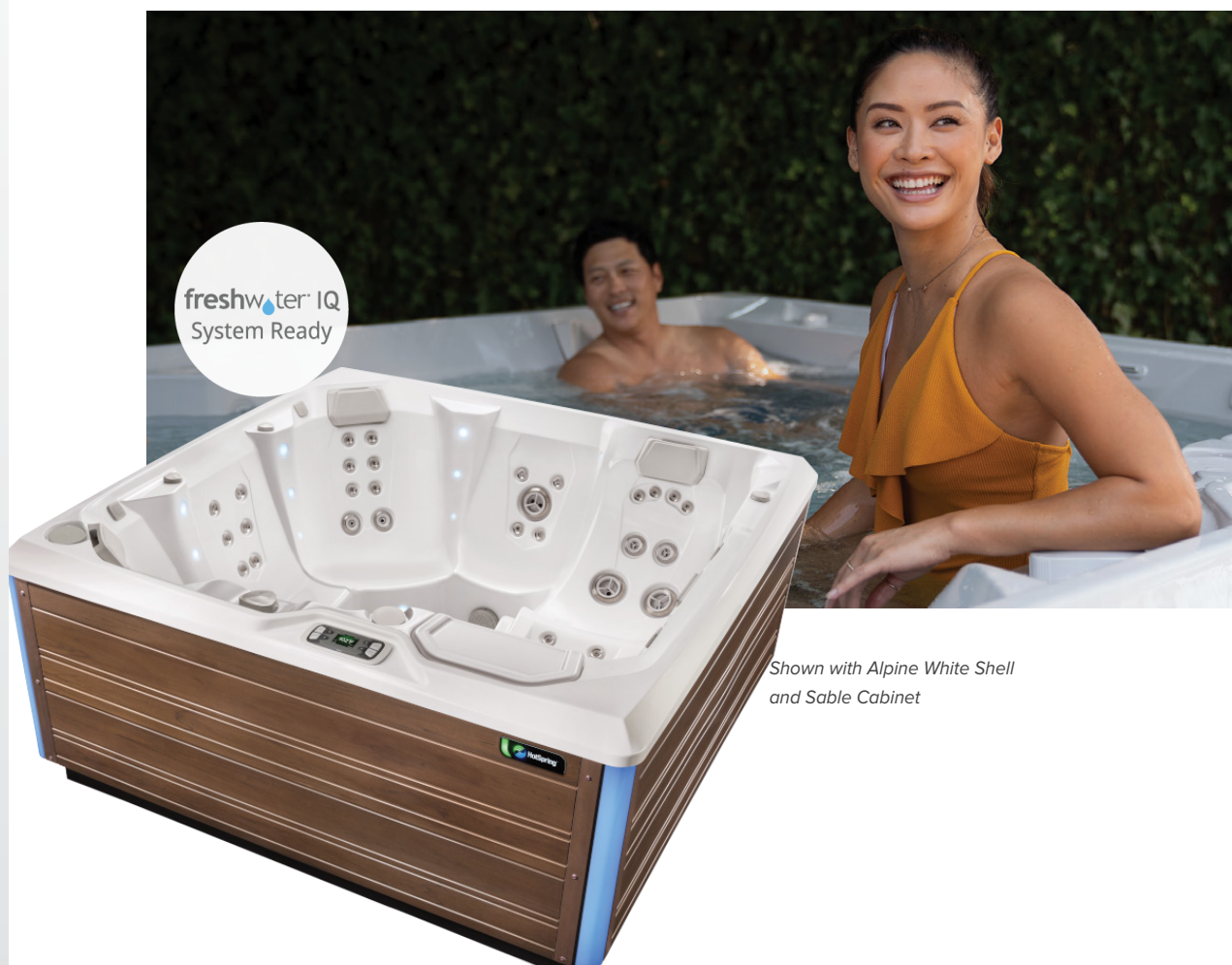
Shown with Alpine White Shell and Sable Cabinet