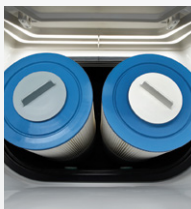
Dual Action Filtration SilentFlo Circulation